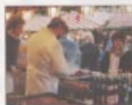
Busy medieval town in Nuremberg

From Nuremberg airport, your hotel is a 15 minute taxi ride.