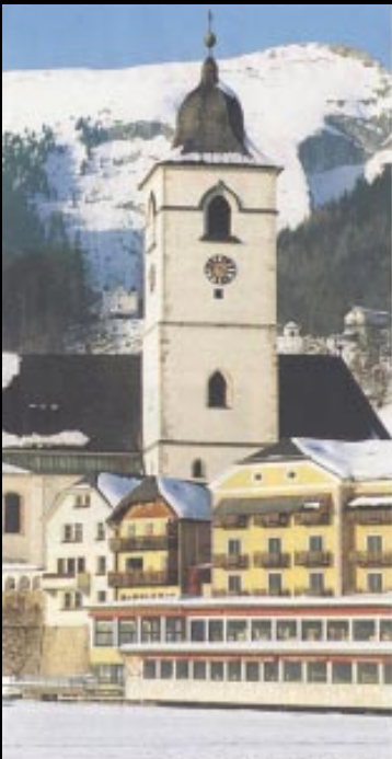
The picturesque village of St Wolfgang

The glorious scenery of the Austrian Lakes unfolds on this wonderful eight night tour. Based in the pretty lakeside resort of St Wolfgang we venture through lovely Alpine landscapes to graceful cities, picturesque villages and pretty, shimmering lakes.