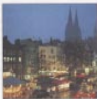
The Old Market, Cologne, at Christmas

Accommodation: Dorint Congress Hotel (4-star), bed and breakfast. This comfortable hotel enjoys a central location, approximately ten minutes' walk from the cathedral. Amenities include a restaurant serving regional and international cuisine, lounge, cosy bar,