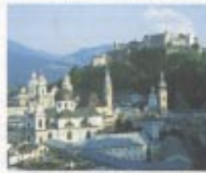
We spend a day in the enchanting city of Salzburg

We journey to Calais for the ferry to Dover and continue by coach to London, arriving at 7.30pm.